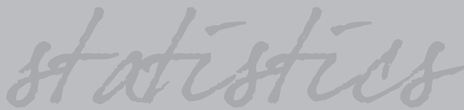
Boxes Exported by Copefrut Season 2008 and 2009